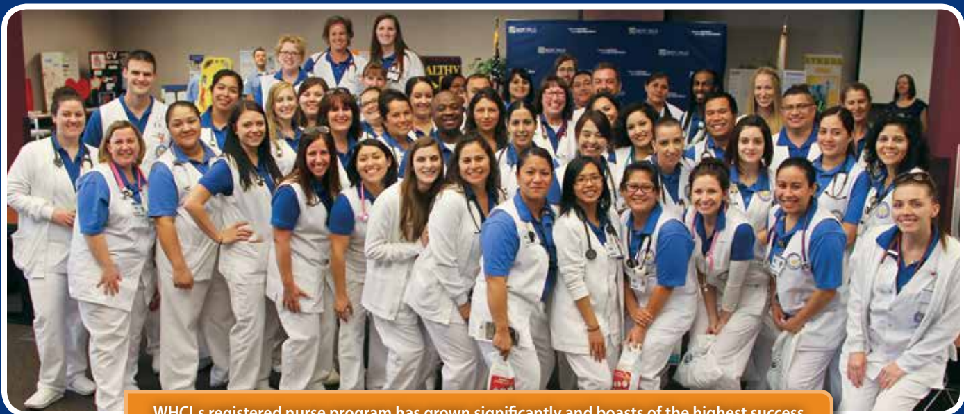
WHCL's registered nurse program has grown significantly and boasts of the highest success rate in California for those taking the registered nurse license exam.