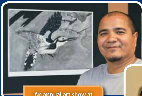
An annual art show at WHCC features the work of student artists.