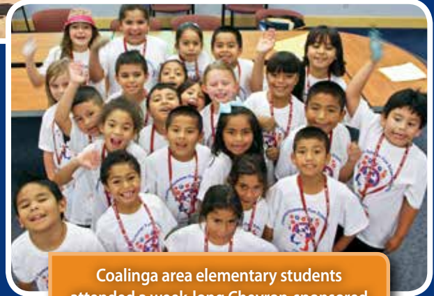
Coalinga area elementary students attended a week-long Chevron-sponsored science camp at WHCC this summer.