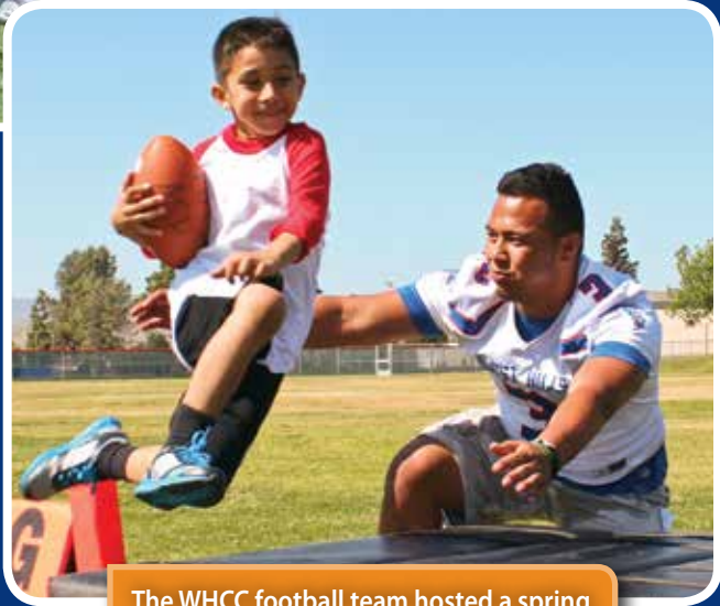
The WHCC football team hosted a spring break camp for local youth.