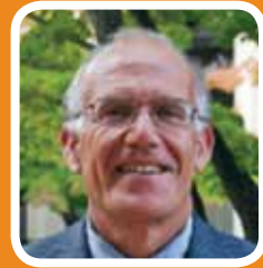
Victor Davis Hanson was one of many distinguished speakers during the Essential Elements Series hosted by WHCCD.