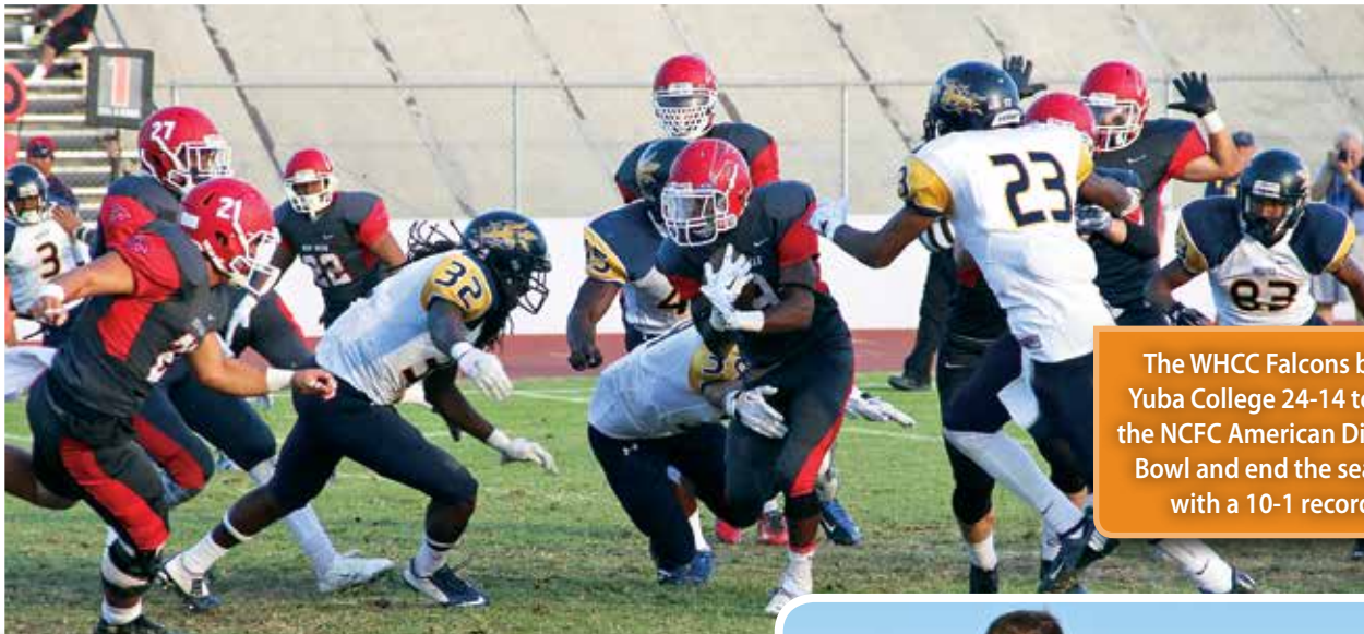
The WHCC Falcons beat Yuba College 24-14 to win the NCFC American Division Bowl and end the season with a 10-1 record.