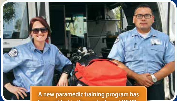
A new paramedic training program has been added to the curriculum at WHCL.