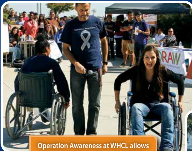
Operation Awareness at WHCL allows students to learn about disabilities.