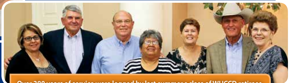
Over 380 years of service were logged by last summer's class of WHCCD retirees.