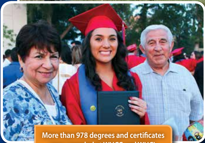
More than 978 degrees and certificates were awarded at WHCC and WHCL —up 65 percent from 2008-2009.