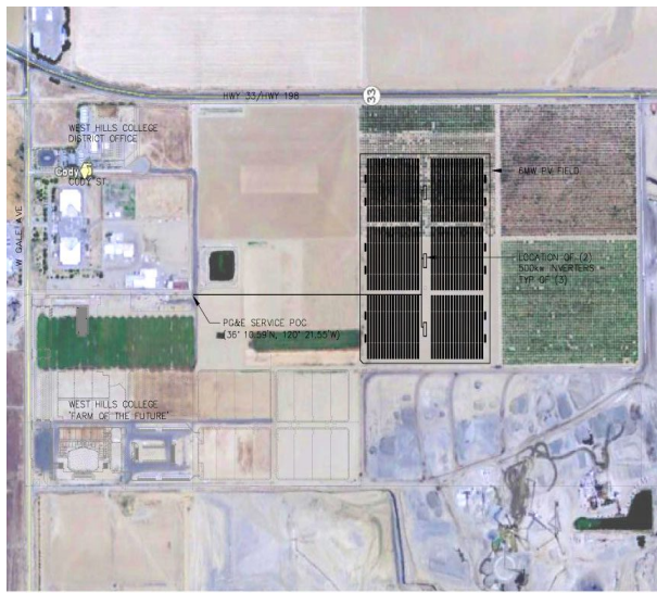
Overall Site Plan SCALE: 1"=600'-0"